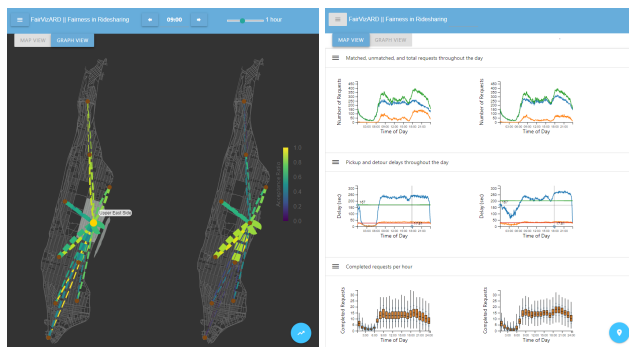
Figure 1: Left to right: (i) Map View of FairVizARD. (ii) Graph View of FairVizARD.

et al. 2017; Shah, Lowalekar, and Varakantham 2020). However, the matches proposed can be unfair (i.e., they have underlying biases that disadvantage certain parties of the system). For example, a matching algorithm that keep drivers in busy areas to maximize their revenue while ignoring requests from passengers in other areas is biased in favor of drivers and against passengers in non-busy areas. Consequently, there is growing interest in analyzing and improving the fairness of matching algorithms (Lesmana, Zhang, and Bei 2019; Nanda et al. 2020).